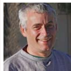
Coordinator of Y Care Charitable Trust

* Y Care Charitable Trust has given P 2 000 000 to charities since 2004