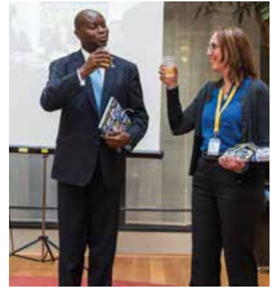
Glimpses from the Botswana 50 book launches from the Ministry for Foreign Affairs in Stockholm and Sanitas in Gaborone.