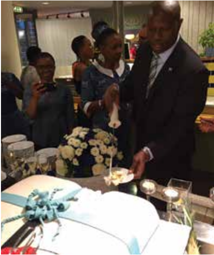
Cutting of the cake at the 50th Independence Anniversary celebration hosted by the Embassy of Botswana at Frösunda Port.